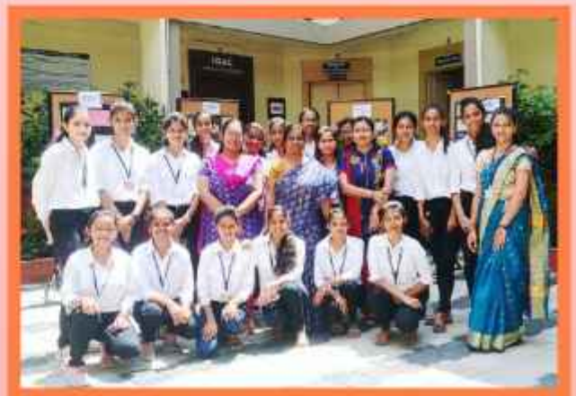
Know Your Currency -Wall Paper display