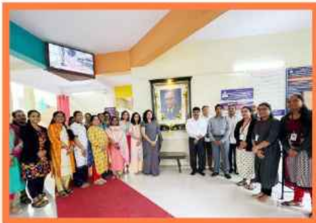
Guru Pournima 13-7-22