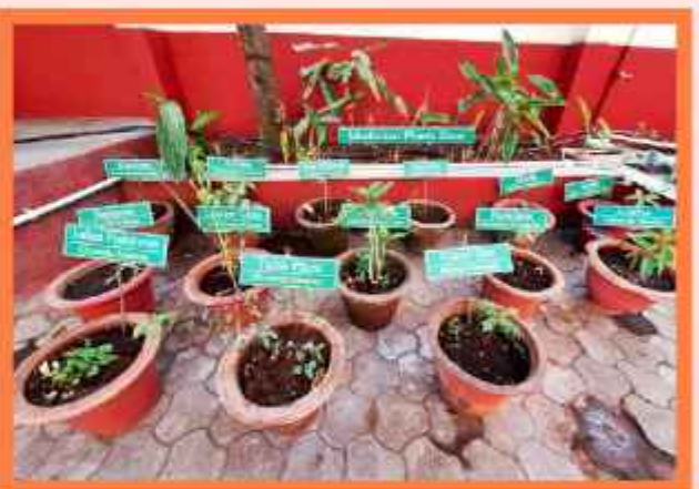
Medicinal Plant zone