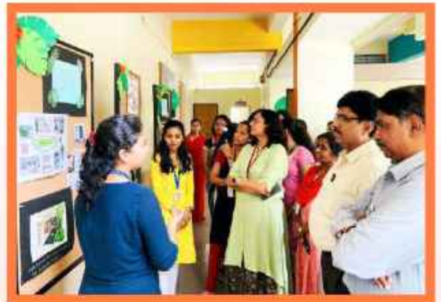
Biophilia Poster Presentation