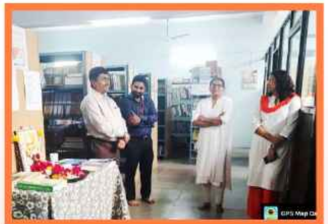
Librarian Day 12-8-22