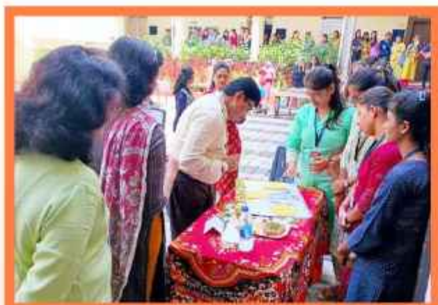
Cooking Competition organised by Dept. of Food Technology on 17 September 2022