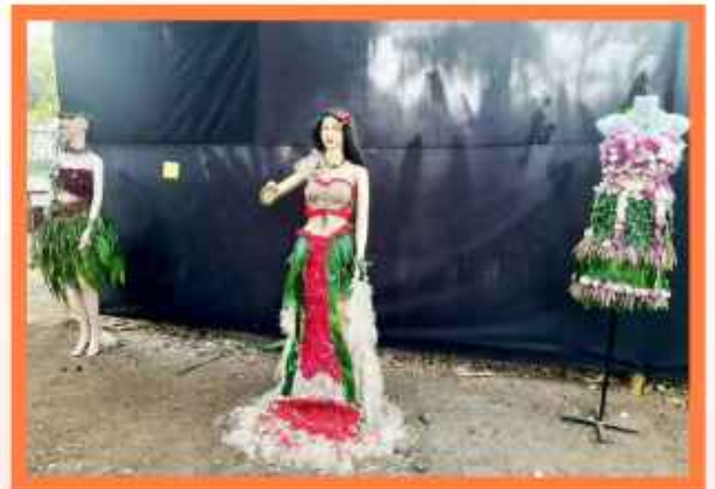
Gardens club manniquinne display by students