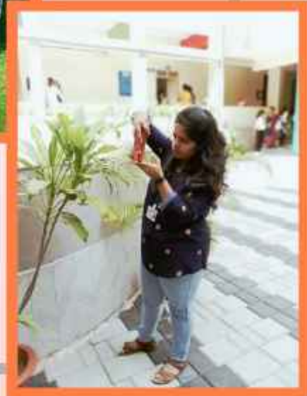
Spot Photography Competetion