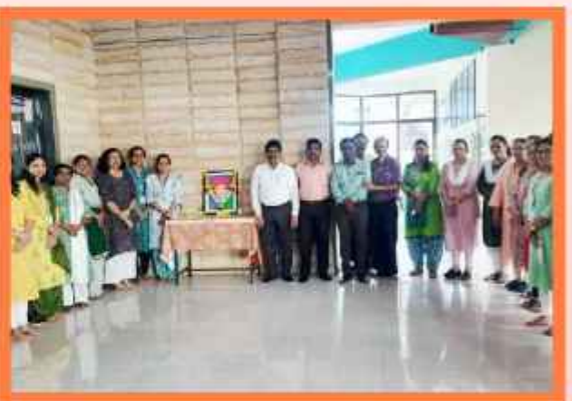
Mahatma Jyotiba Phule Jayanti 11-4-23