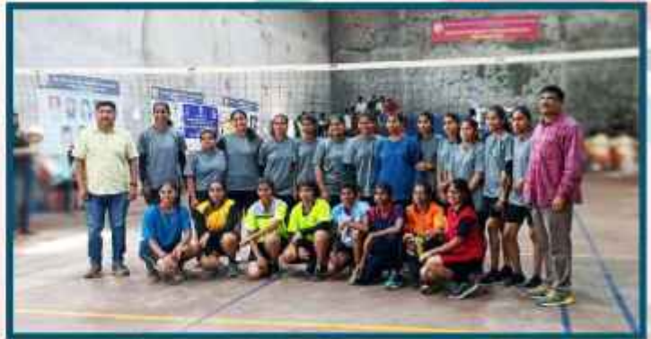
Shivaji University Zonal Volleyball Tournament 2023