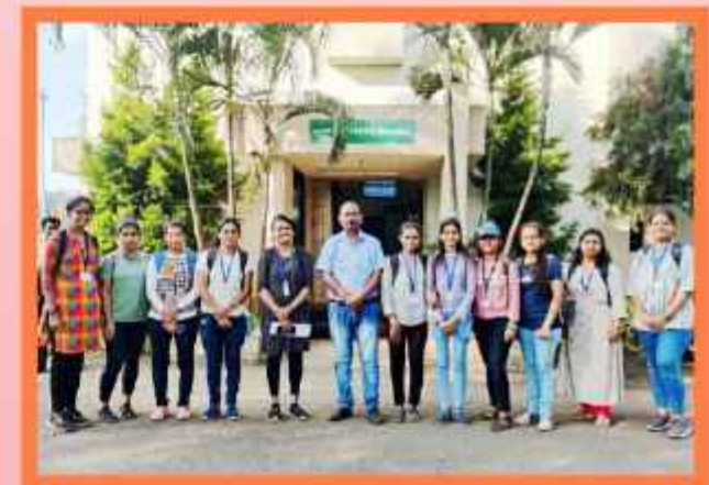
Common Effluent Treatment Plant Visit, Kagal 27 Dec. 2022