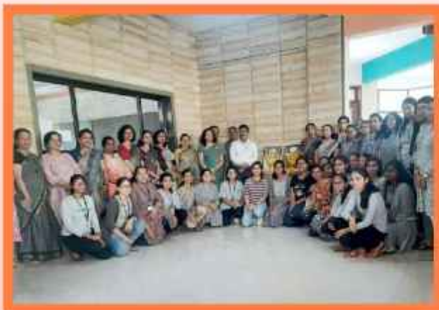
Gandhi Jayanti 2-10-22