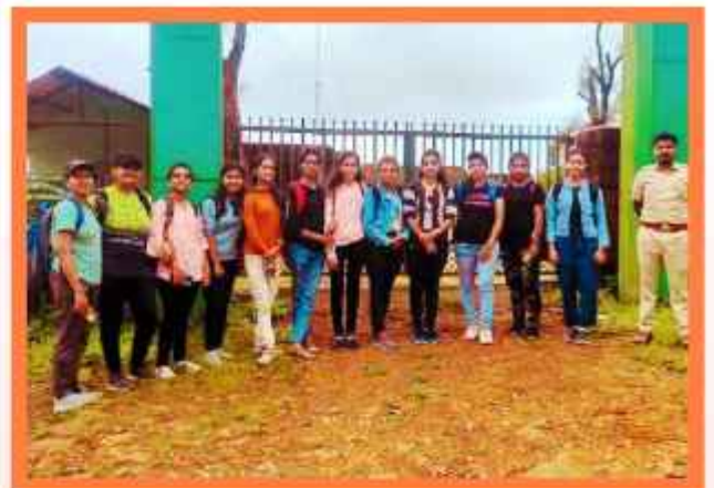
Radhanagari Wildlife Sanctuary 23 Sept. 2022