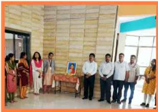
Savitribai Phule Jayanti 3-1-23