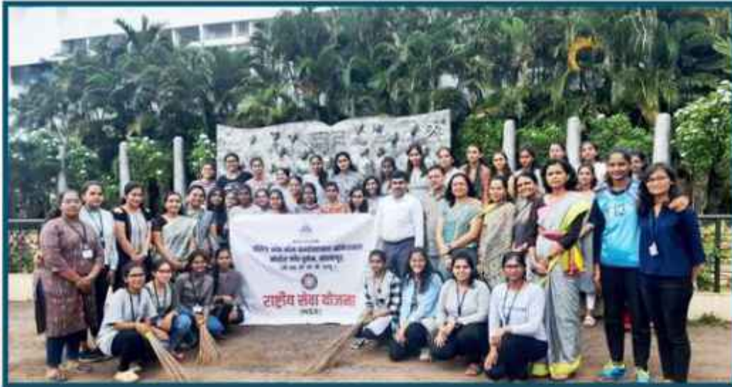
CNCVCW NSS Volunteers and Teaching and Non-teaching staff enthusiastically participated in the cleaning activity on 02 nd October 2022 "Gandhi Jayanti"