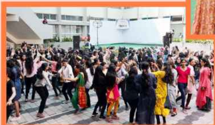
Students enjoying the event