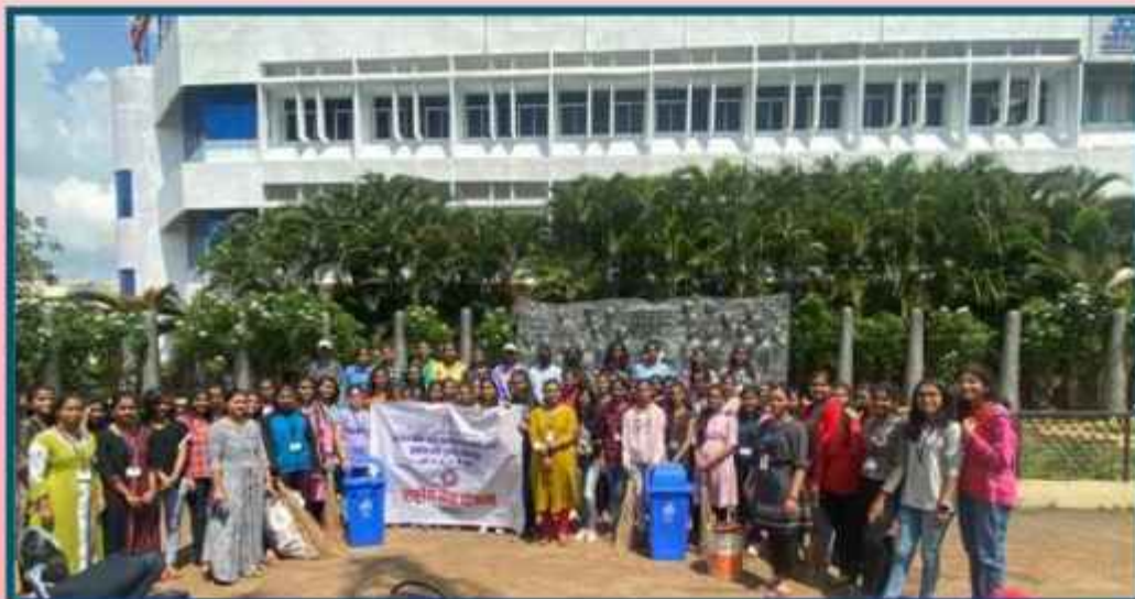
Clean India Campaign on 19th October 2022