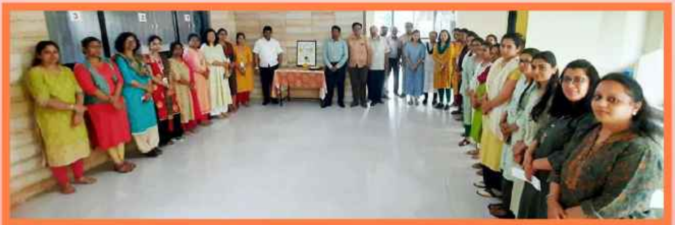
DR. Babasaheb Ambedkar Jayanti 14-4-23