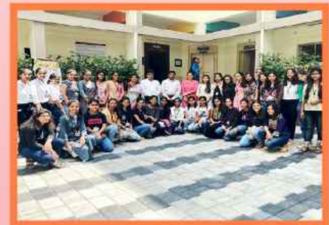
Landscape Model Making and Display