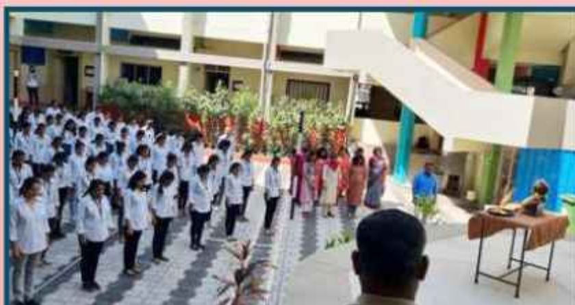
Rajarshi Shahu Maharaj Death Anniversary 06th May 2023