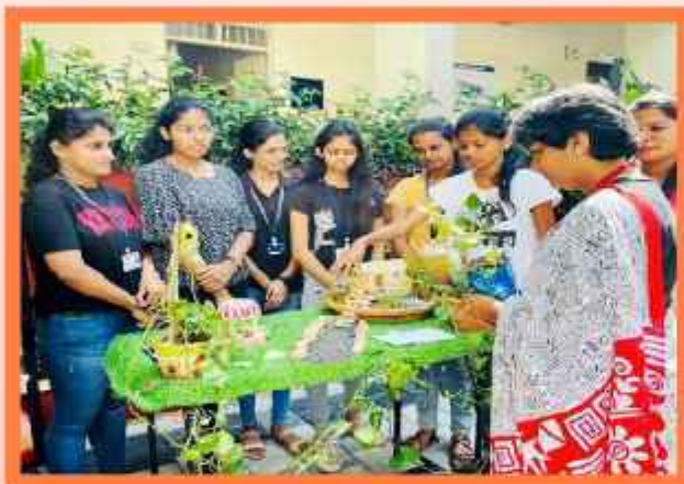
Landscape Model Making and Display