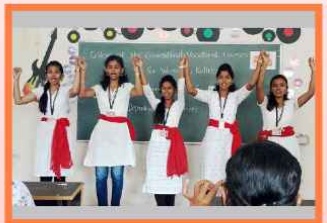
Role play on consumer rights