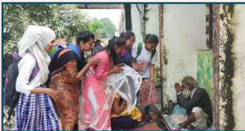
NSS Volunteers while distributing Diwali Faral (Sweets) to porters and beggars on the occasion of Diwali 2022