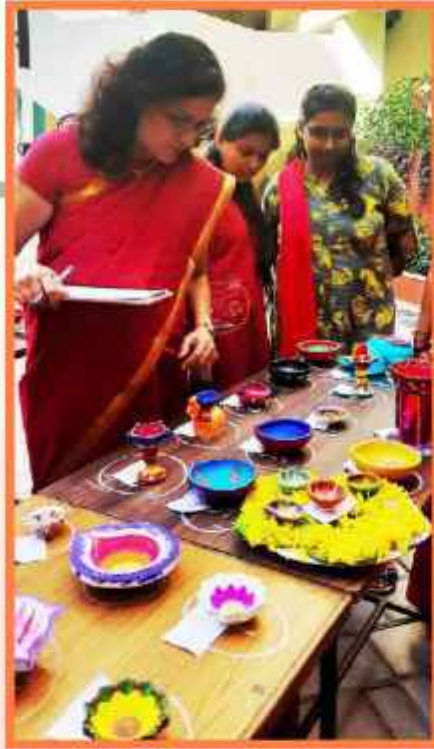
Diya Painting Competition