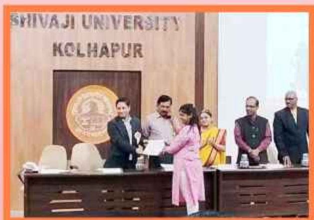
Participation of Students in Avishkar Research Project Competition