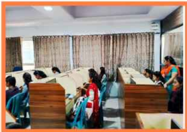
Add on Course Computer Applications