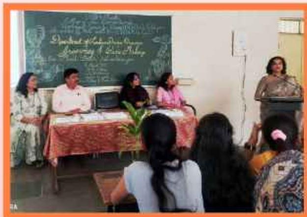
make up and grooming workshop