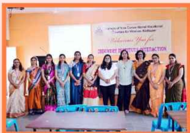
Industry Institute Interaction organized by Dept. of Food Technology on 9 March 2023