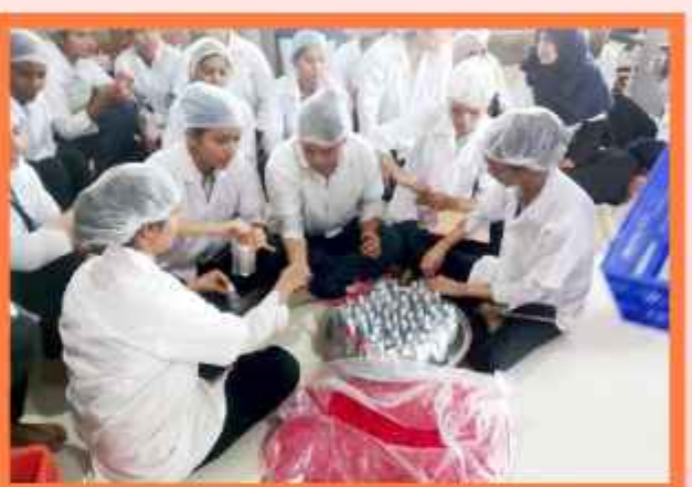
Field Visit to Piyush Canning Centre B.Sc. (FTM) III year students on 24 March 2023