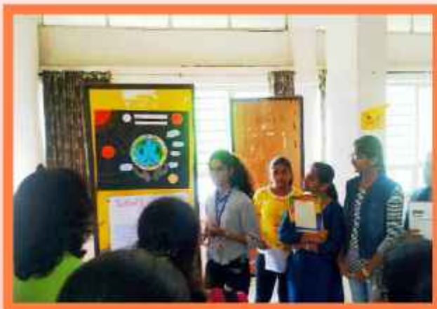
Ozone day celebration 17sept. 2022