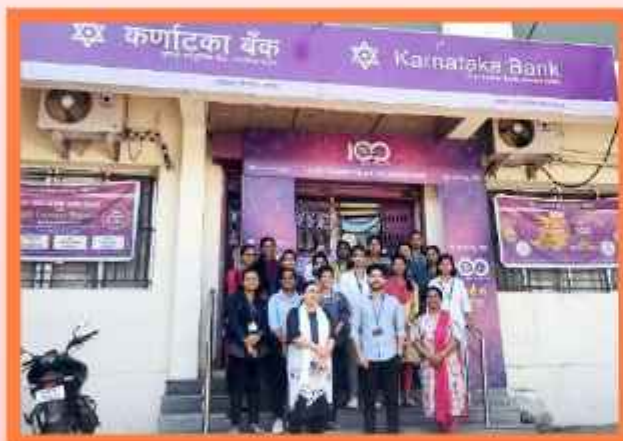
Field Visit to Karnataka Bank