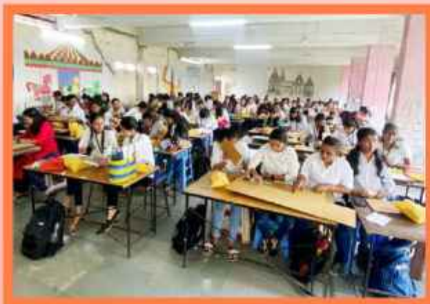
Add on Course on Designing of Artifacts