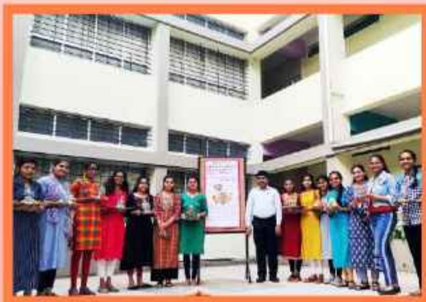
Eco friendly Lord Ganesha Idol making 2022-23