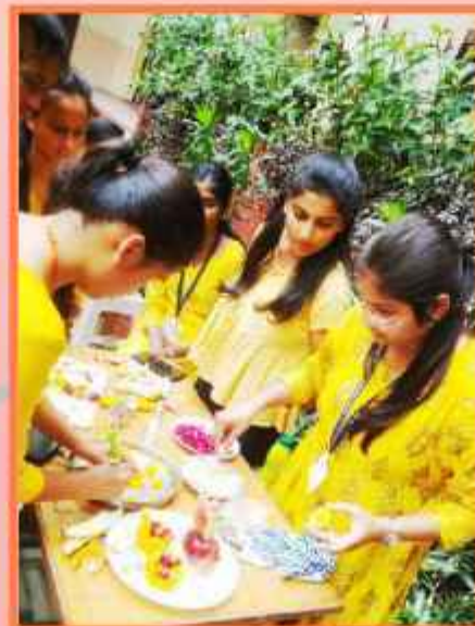
Fruit Carving Competition