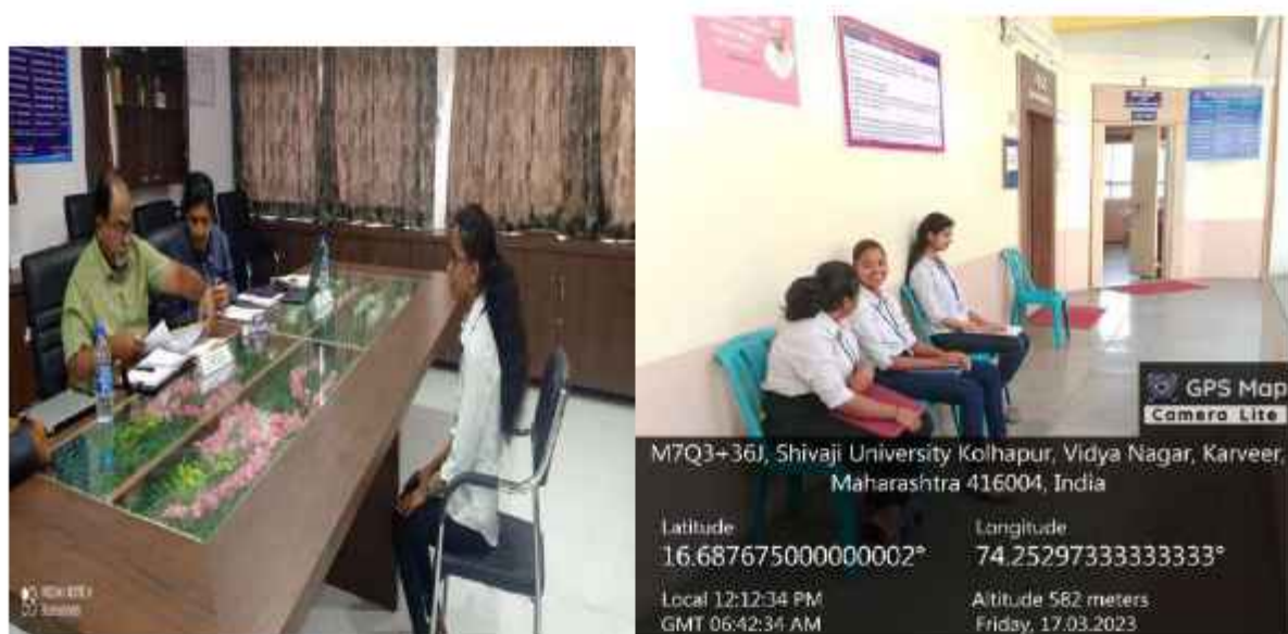
Student of Fashion Design- Part III attending the interview