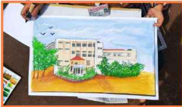
On the Spot Painting