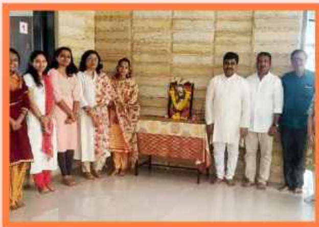
Shivaji Maharaj Jayanti 19-2-23