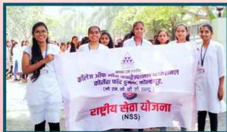
'Nasha Mukta Bharat Abhiyan' rally on 26th November 2022