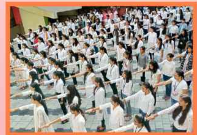
Constitution Day 26-11-22