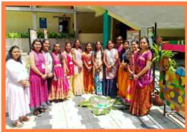
Wildlife week celebration 4 Oct. 2022