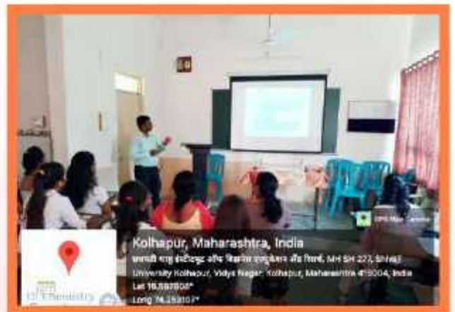
Guest Lecture on Audit Diwas