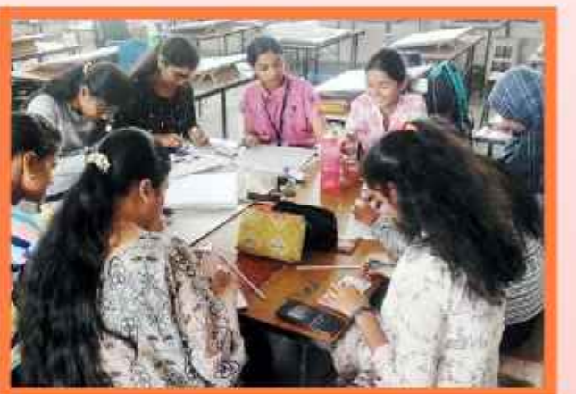
Model Making Workshop