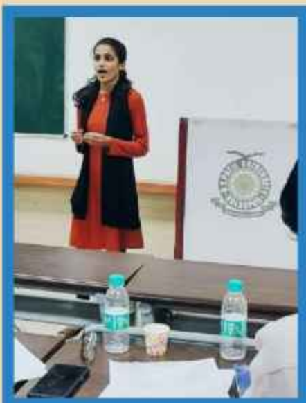
Tanjila Momin Elocution Competition