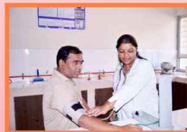
Health Check-up Camp organized by Dept. of Food Technology and IQAC on the occasion of International Woman's Day for Staff on 8 March 2023