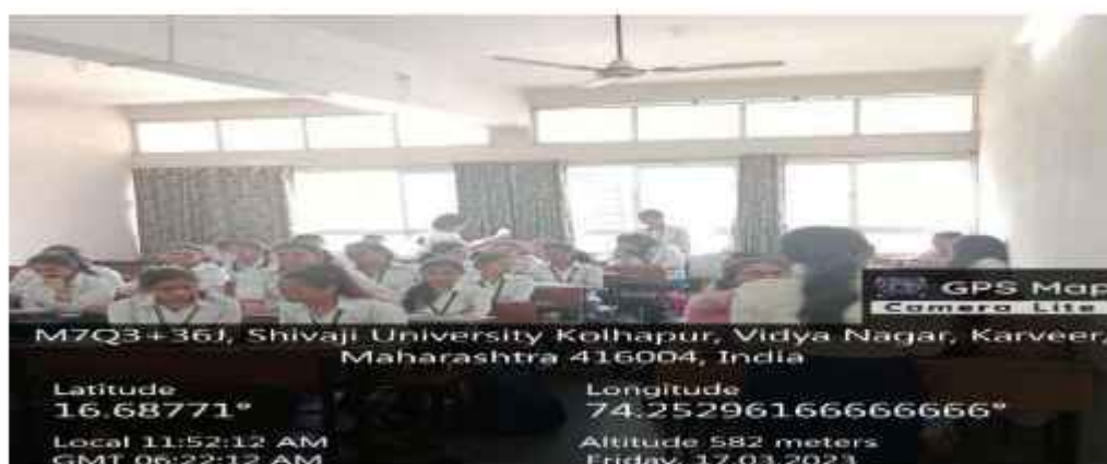
Student of Fashion Design- Part III