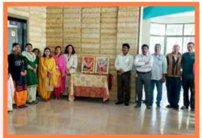
Vivekanad & Jijabai Jayanti 12-1-23