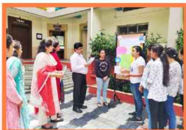
Cooking Competition organised by Dept. of Food Technology on 17 September 2022