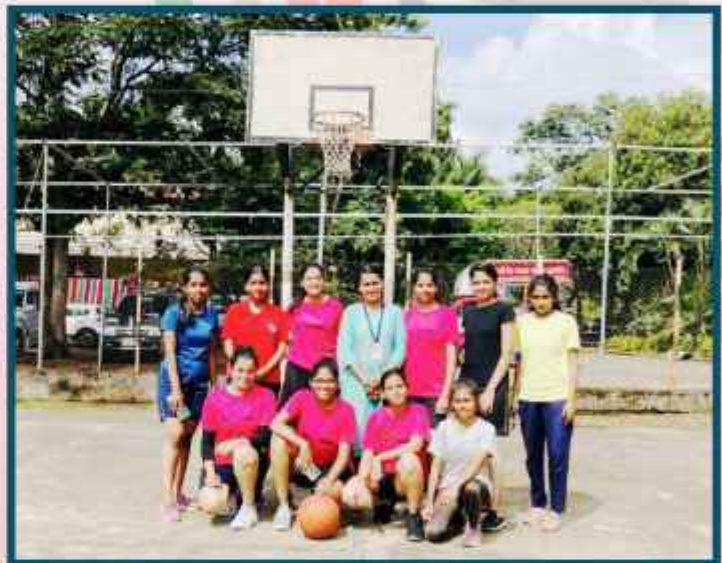
Shivaji University Inter-Zonal Basketball Tournament 2022-23