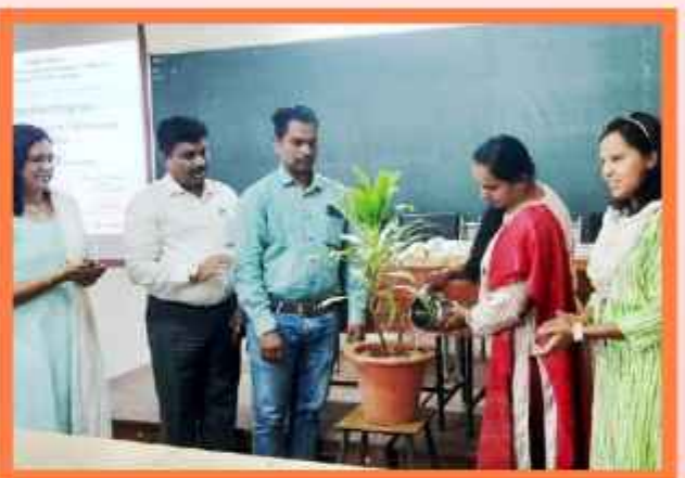
Innugeral programme for 6 days Pidilite workshop