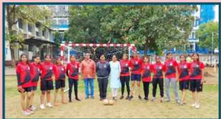
Inter Zonal Handball Shivaji University Tournament 2022-23