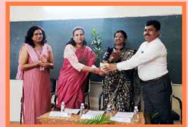
Guest lecture on women empowerment on the occasion of womens day