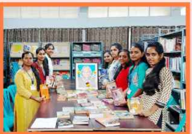
Vachan Prerna Din 15-10-22