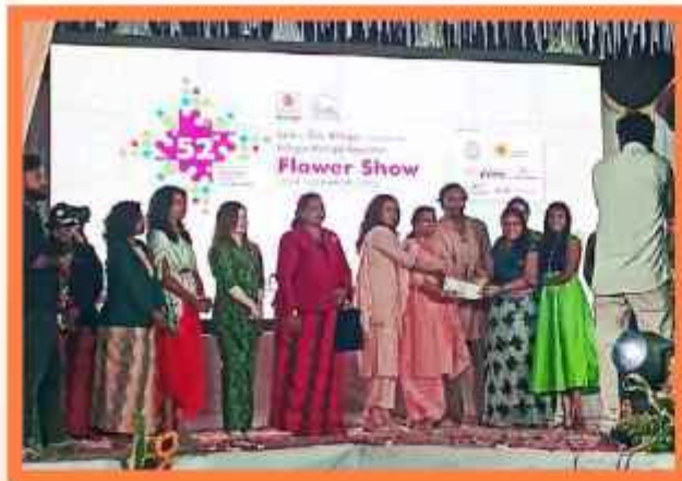
Gardens club botanical fashion show winnes