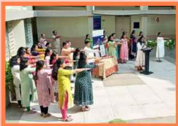
Constitution Day 26-11-22