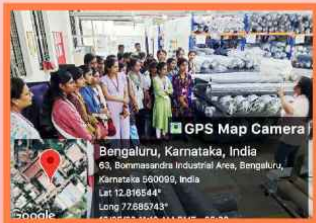
Industry visit at Silver Crest garment export house Bengaluru.