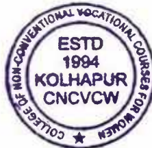
Principal College of Non-Conventional Vocational Courses for Women Kolhapur