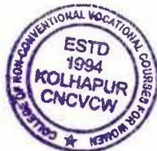
Principal College of Non-Conventional Vocational Courses for Women Kolhapur