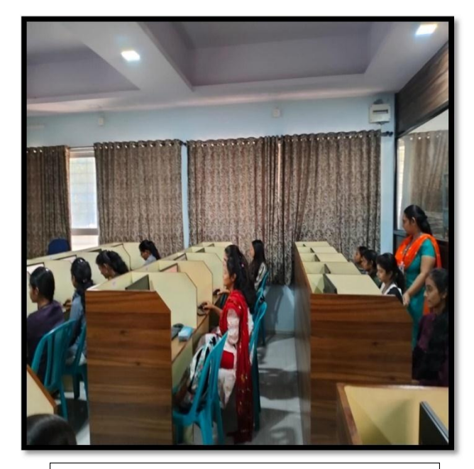
Add-on Course – Basics of Computer Application