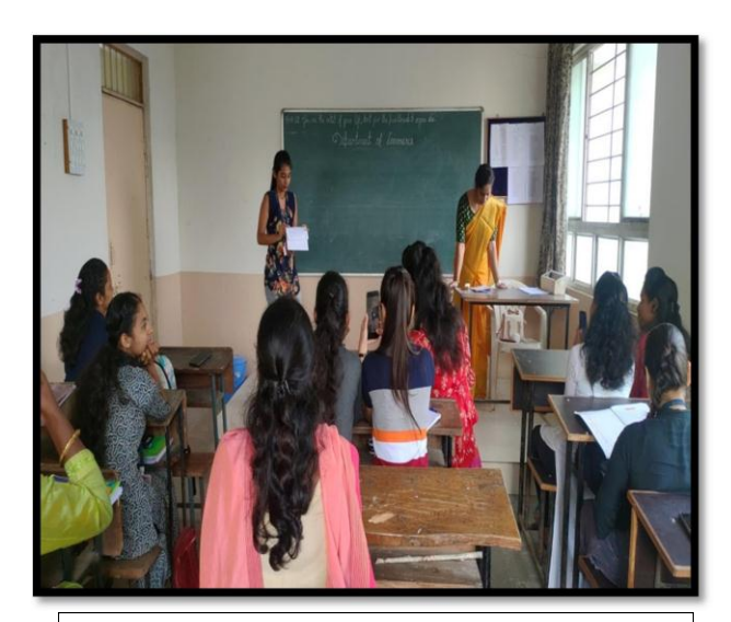
Guest Lecture on Quantitative Techniques