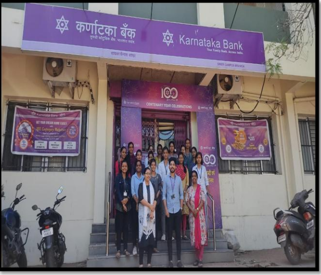
B.Com. (Bank Management) First Batch Pass out 2022