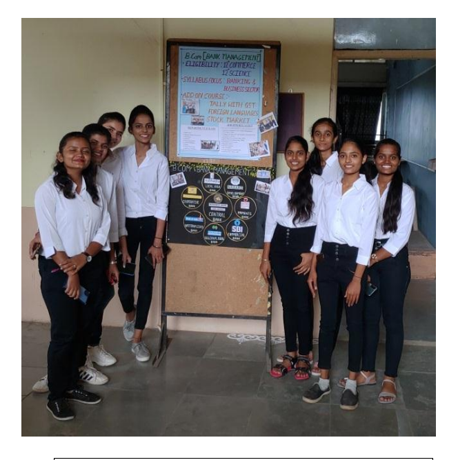
Wall paper display 2022-23