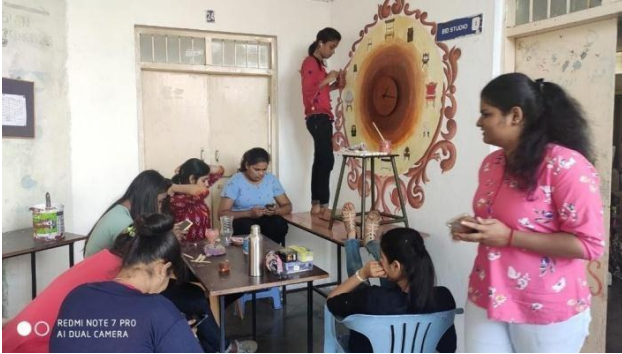
BID students working for annual Exhibition