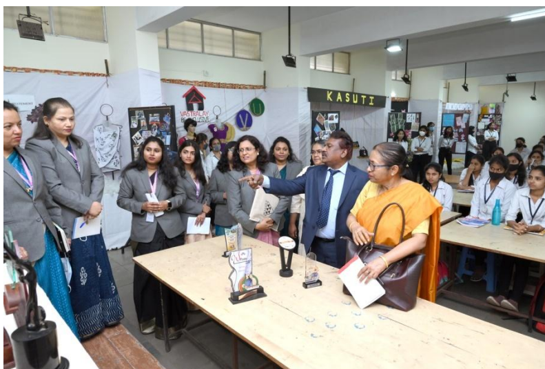
NAAC Peer Team Visit to the Fashion Design Department