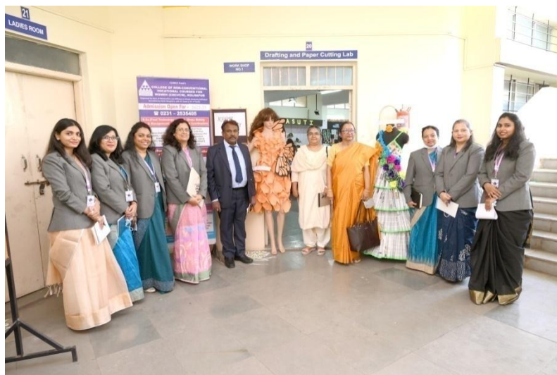
NAAC Peer Team with Fashion Design Department Faculty