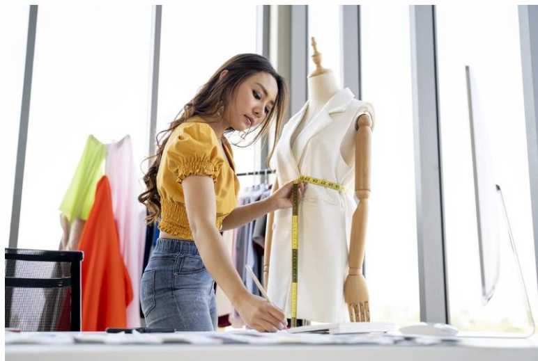
Designer working on her Creation