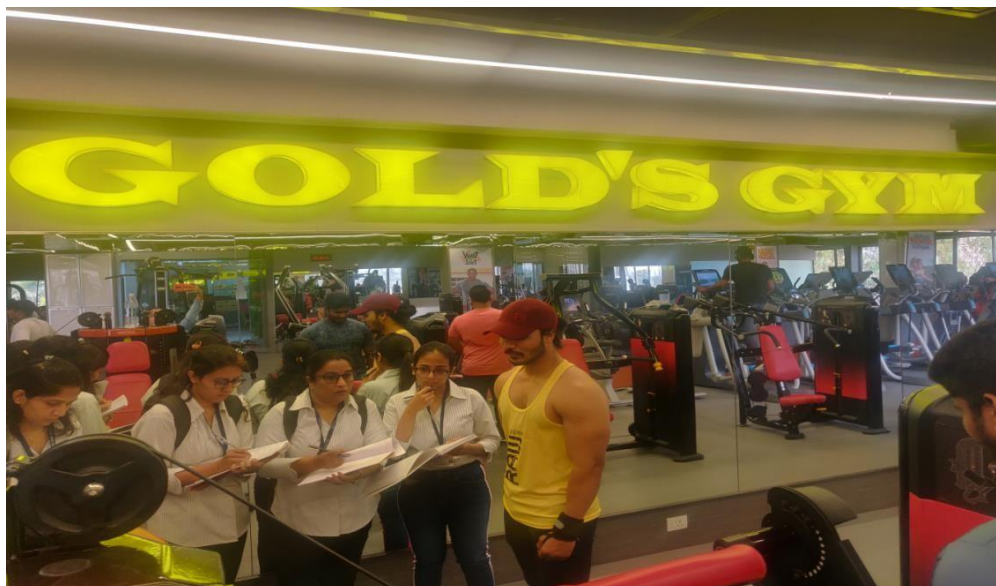
Field visit to GOLD'S Gym Kolhapur (MoU Activity)

which various types of trainings, visits, workshops, competitions etc. are conducted for the students.