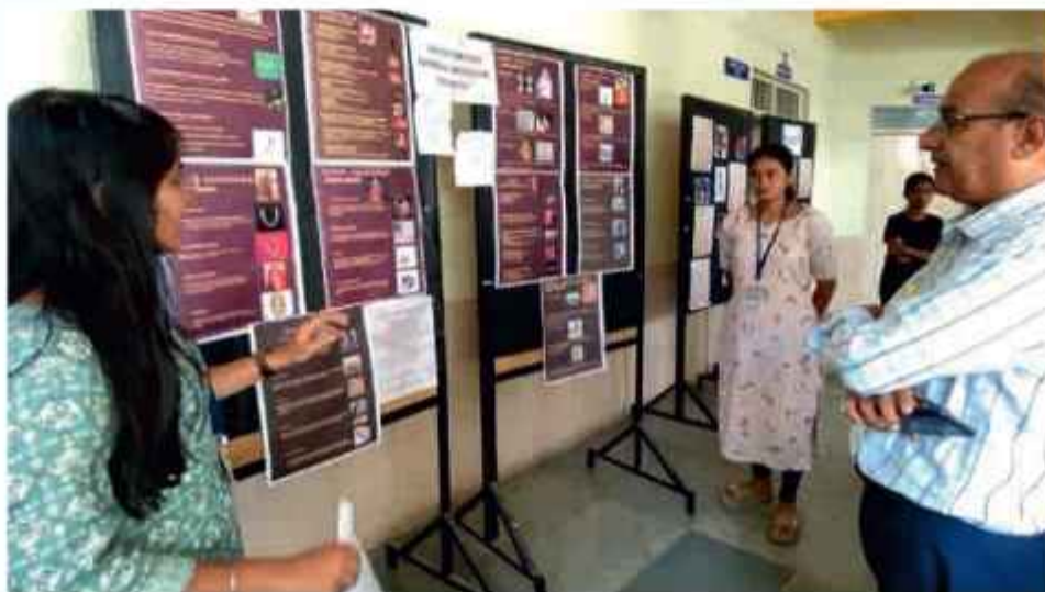
Wall paper display of World Costumes subject on topic "Accessories for Men & Women" by 3rd year students