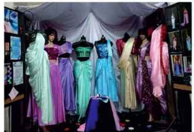
Apparel Design Display on Theme, Indo-western