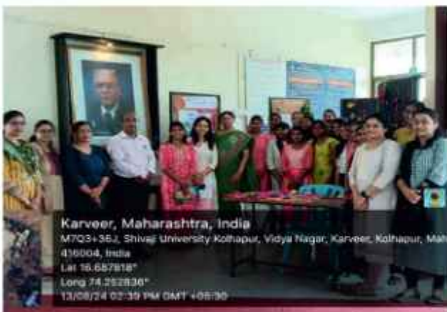
Display and sell of eco-friendly rakhis