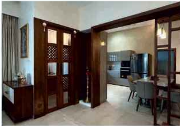
Group Photo During Site Visit Student's observing various spaces of residential building