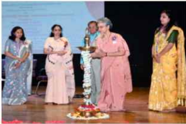
National Conference - Inauguration