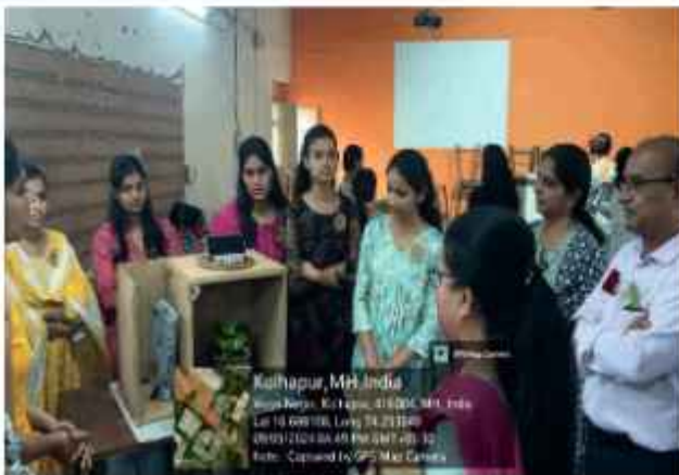
Student's explaining the products to the Jury