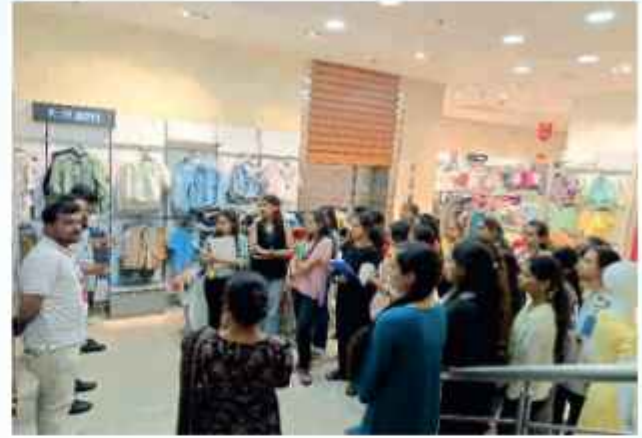
Student's observing different spaces of Reliance Trends