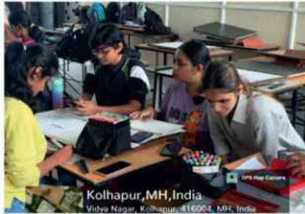
Student's learning various techniques of rendering