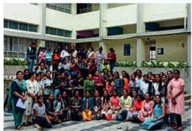
Eco-friendly god ganesha making programme by Dept. of Environment Science Total 85 students from all departments prepared eco-friendlygod Ganesha idols from clay