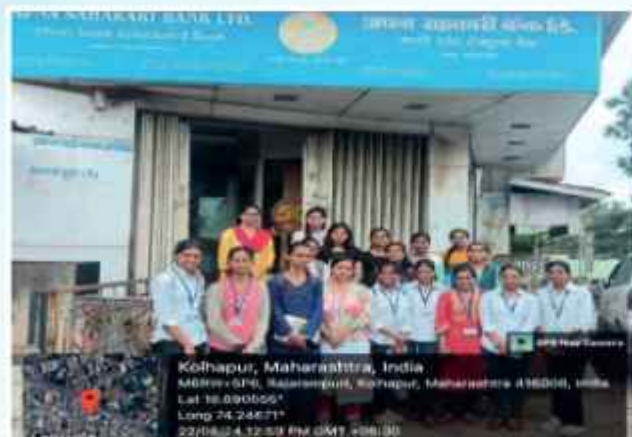
Field Visit to Apna Sahakari Bank Ltd.