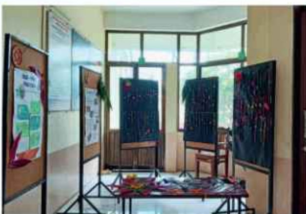
Display of eco-friendly rakhis made by students