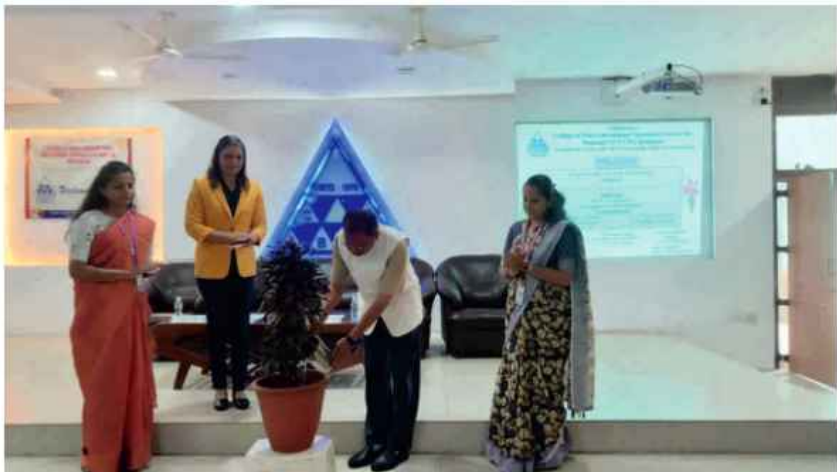
Inauguration of Industry-Institute Interaction 2024-25