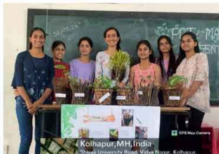
GROUP 'E' (MEDICINAL PLANTS) Presentation