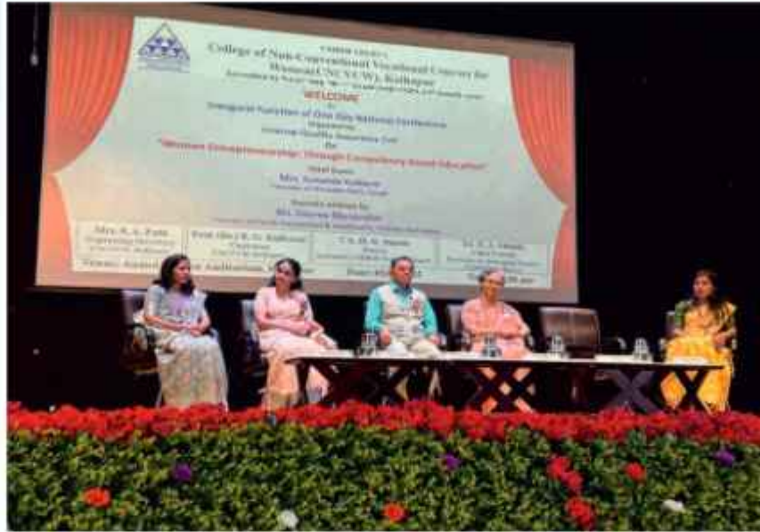
National Conference on, "Women Entrepreneurship: Through Competency Based Education"