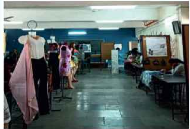
Best out of Waste Products made by students