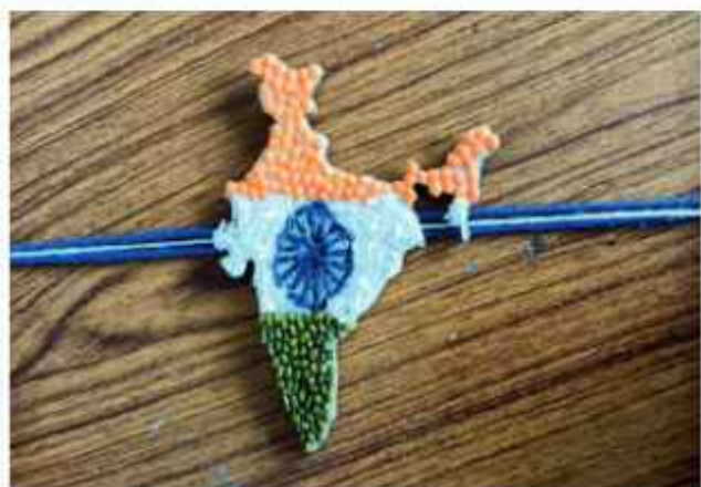
Preparation of Eco-friendly rakhis by students