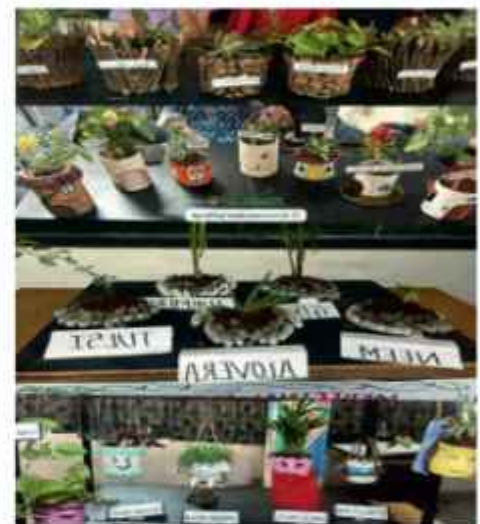
Student Work Display