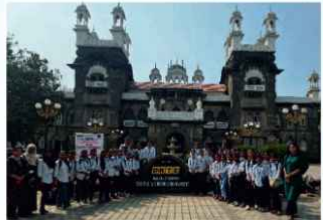
The 1st year students at the Industrial Visit to DKTE college on 18th January