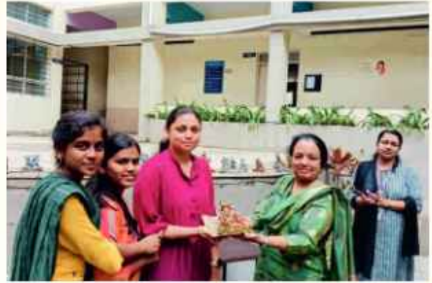
Eco-friendly Ganesha Idol making workshop