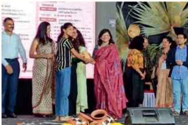
First prize - Mannequin Display competition Gardens Club, Kolhapur