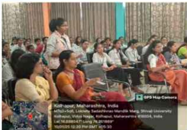
Students' interaction with Resource Person