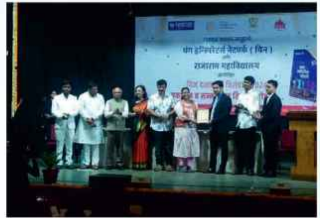
Best Programme Officer