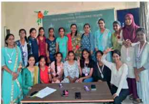
Induction Program of B.Com. (Bank Management)