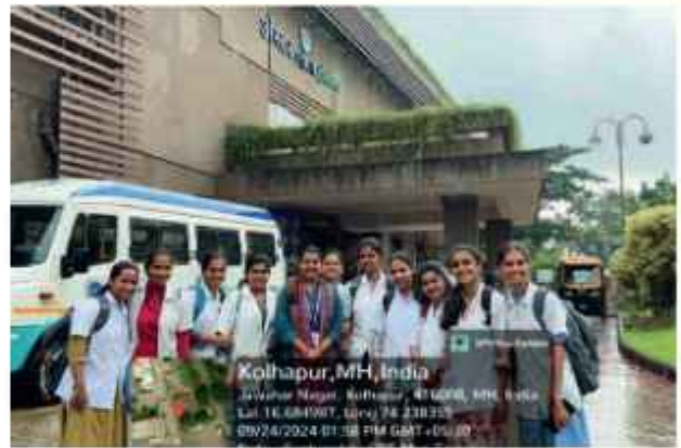
Study Tour to Aster Aadhar, Kolhapur