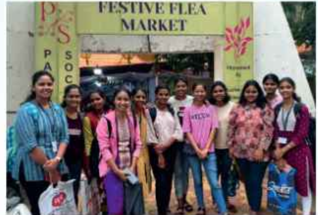
Exhibition Visit to Festive Flea Market, Kolhapur, for 1st, 2nd, 3rd Year Students