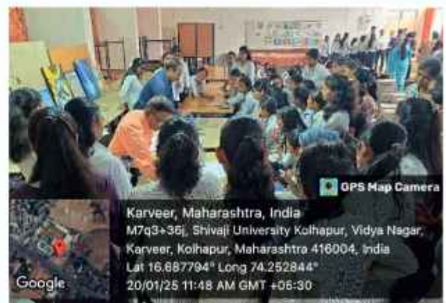
Craft Demonstration & Awareness Program Students learning painting at Craft and Workshop for all fashion design students Demonstration Workshop on 20th January