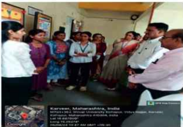
Students of B.Com. (Bank Management) explaining their Posters on International Commerce Day