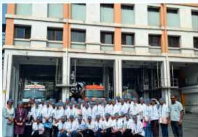
Study Tour of B.Sc.(FTM) I students to Gokul Dairy