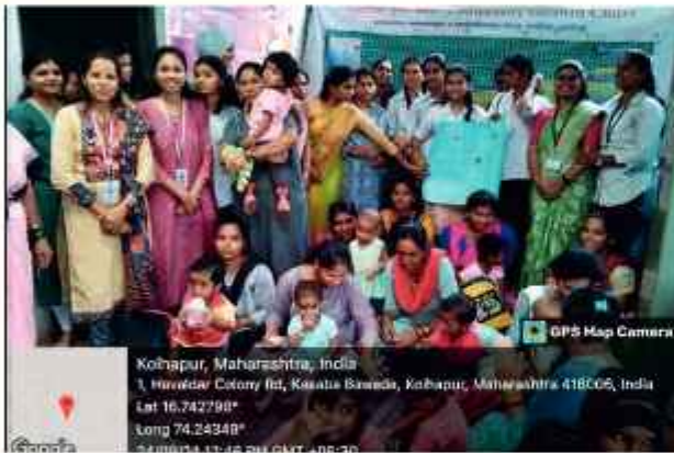
Social Outreach activity at Anganwadi, Kasaba Bawada