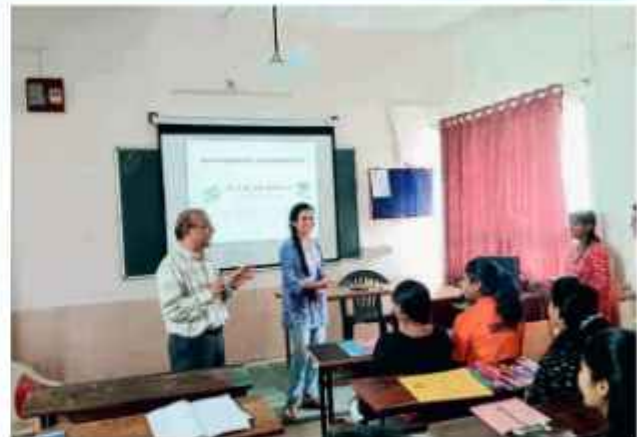
Guest lecture was conducted in interactive way