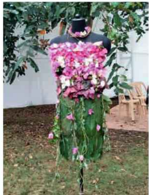
Mannequin display of our students, at Gardens Club, Kolhapur competition