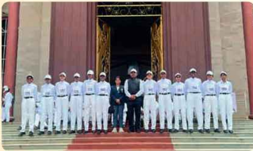
Pre-Rd Camp SRTMUN Nanded University