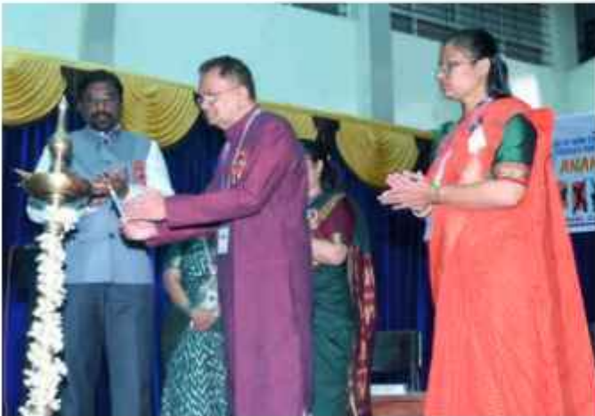
Lightning of lamp by dignitaries