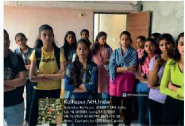
Students observing the aluminum framing During Site Visit