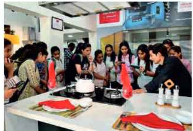
Students observing technology of modular kitchen