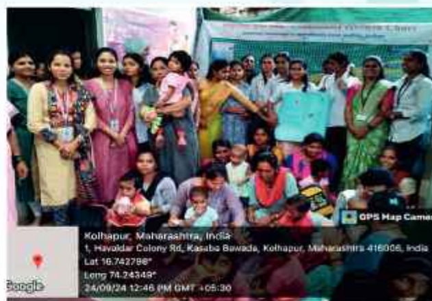
Social Outreach activity by M.Sc. ( FSN) I & II students and Faculty members at Kasaba Bawada Anganwadi