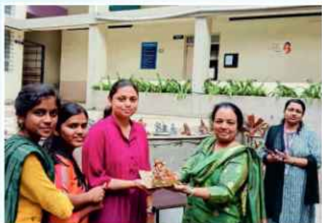
Students received second rank in eco-friendly god Ganesha idol making