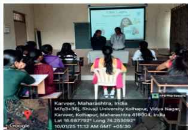
Students while presenting their topics based on women entrepreneurship in India.