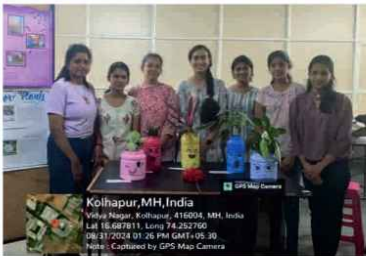
GROUP 'C' (OUTDOOR PLANTS) Presentation