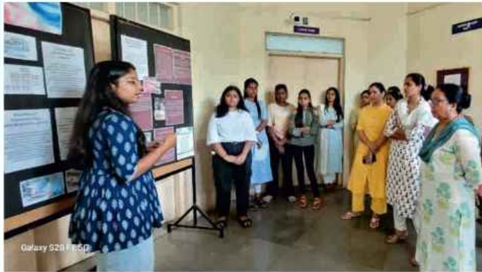
Wall paper display of Apparel Production and Quality Control subject on topic "Process on Apparel Industry" by 3rd year students