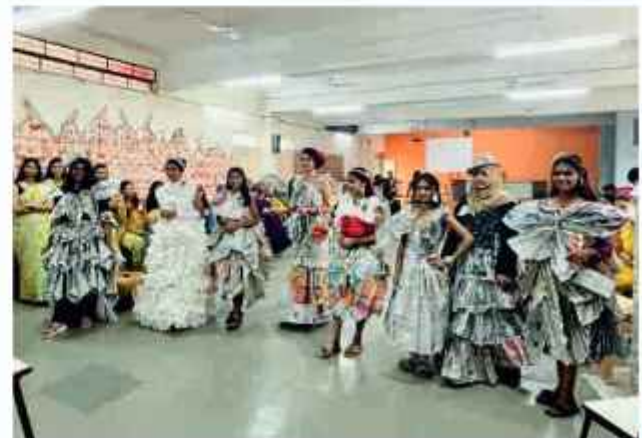
Paper Dress Making Competition