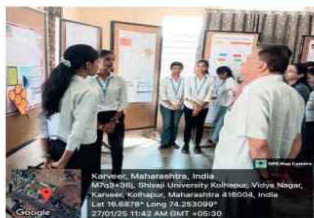
Students of B. Com. (Bank Management) explaining poster to Guest.