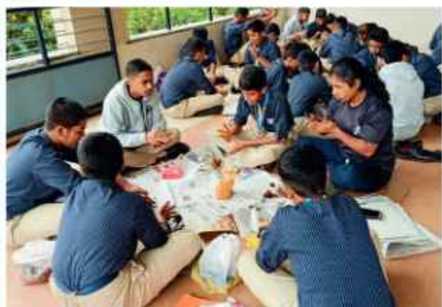
Students from RSEMS Global prepared god Ganesha idols from clay