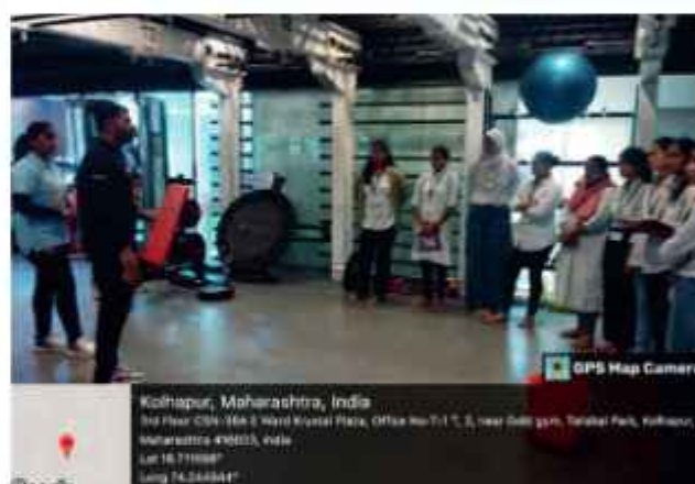
Study Tour of M.Sc.(FSN) II students to Gold Gym, Kolhapur