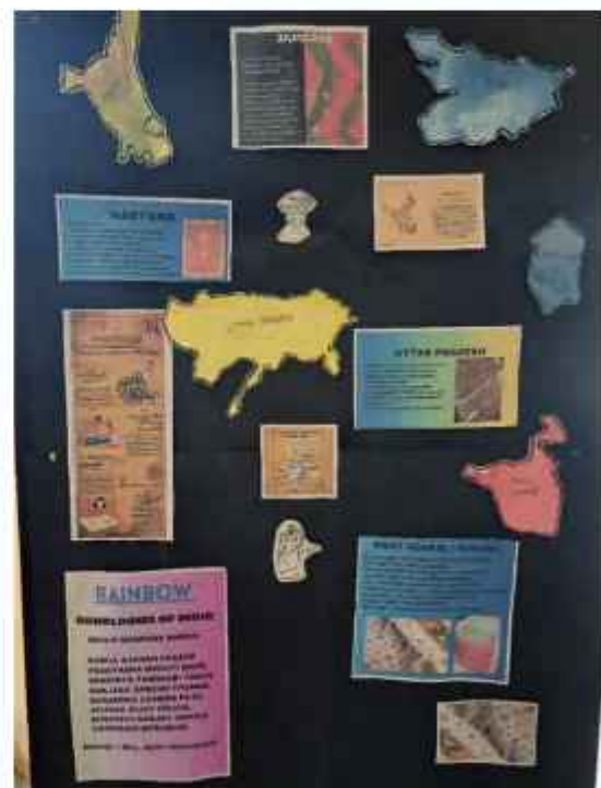
Wall Paper Display on Handloom Day made by 3rd Year Students