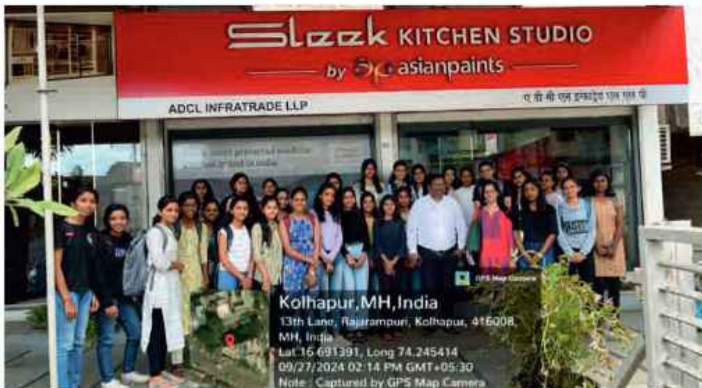
Group Photo During Site Visit