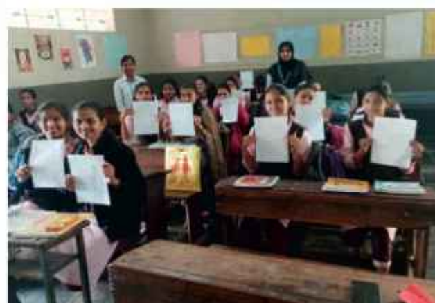
Students conducting online and offline banking awareness survey in various colleges