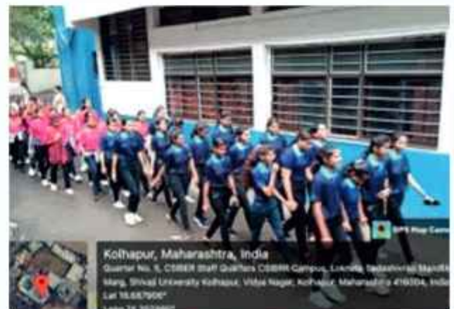
Tiranga Rally Photo with Presented Students and Staff