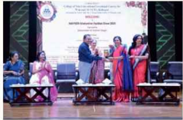
Navyata Graduation Fashion Show Felicitation of Guest