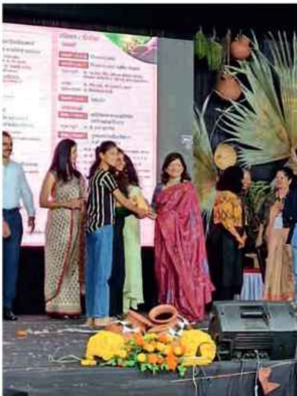
Fashion design 3rd year two students participated and won 1st prize in Gardens Club, Kolhapur competition held on 8th December