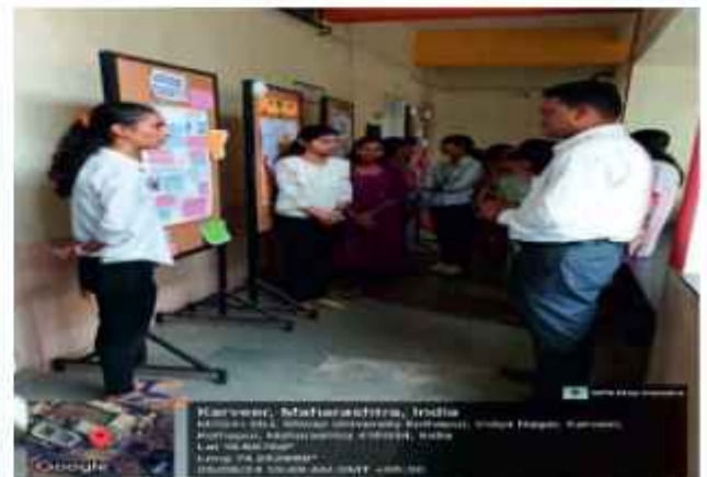
Students of B.Com. (Bank Management) during wallpaper display