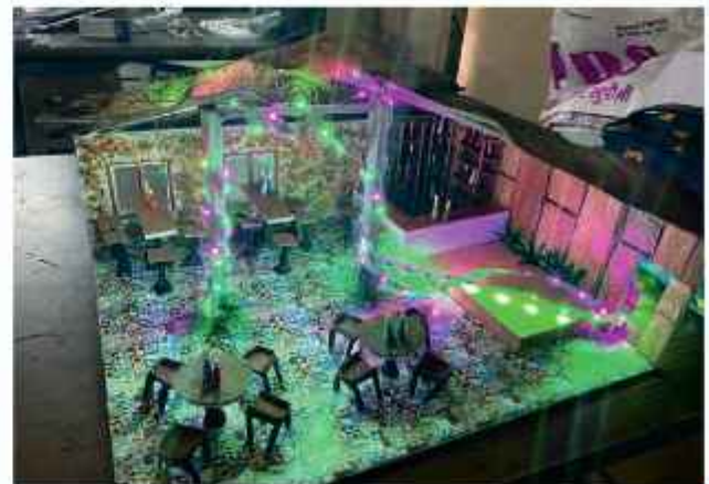
Students making models during the workshop