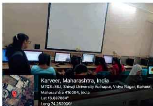
MS Office workshop attended by the M.Sc. FSN II students