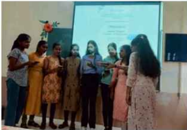
Welcome of First year students by Second year students in induction programe.