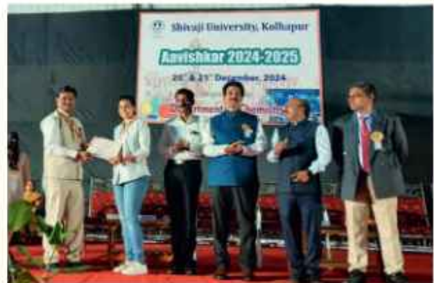
Second Prize - Avishkar Research Competition Shivaji University, Kolhapur