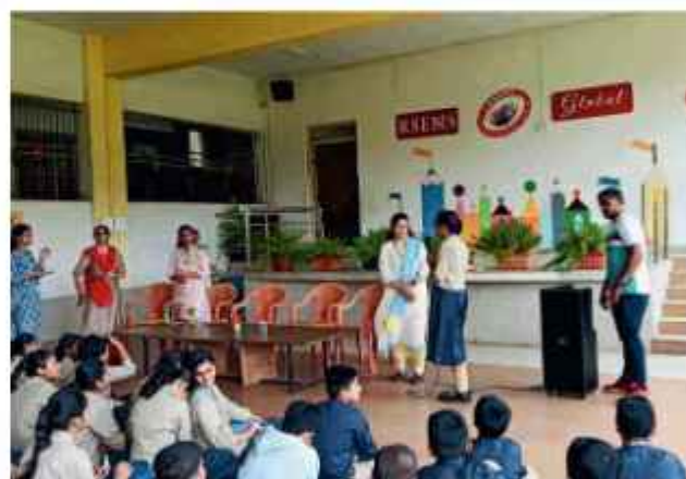
Inauguration function of eco-friendly god Ganesha idol making workshop