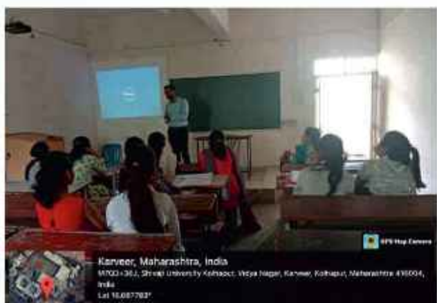
Heartfulness Meditation workshop attended by M.Sc. FSN II students