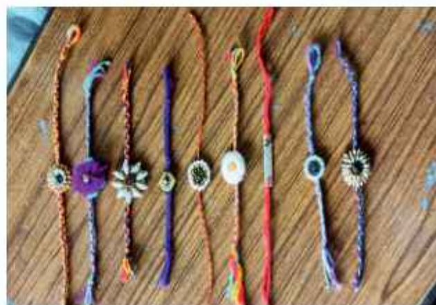
Eco-friendly rakhis made by students