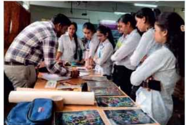
Students learning jewellery making at Students learning calligraphy at Craft Craft Demonstration Workshop