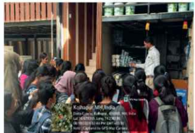
Students observing various members and construction methods of false ceiling