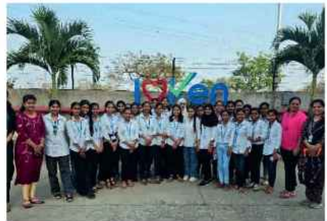
Industrial Visit of 1st year students to Ken Industry on 18th January