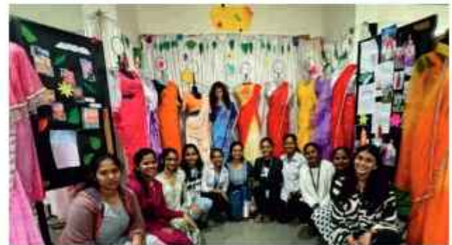
Apparel Design Display on Tie Dye Techniques Group -1 & group -2 Students with their Garments