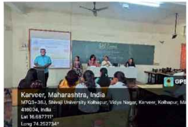
5 Days Pidilite Art Workshop for 1st year students INDUSTRY INSTITUTE INTERACTION