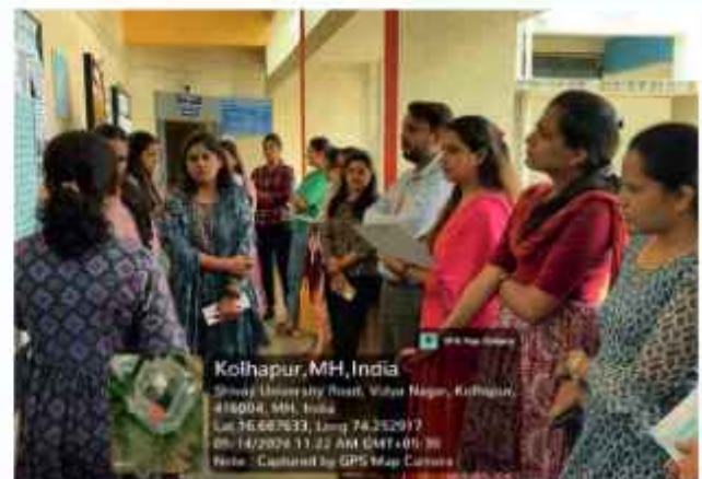
Wall Paper Display on Importance of Breast Feeding by PGDND students