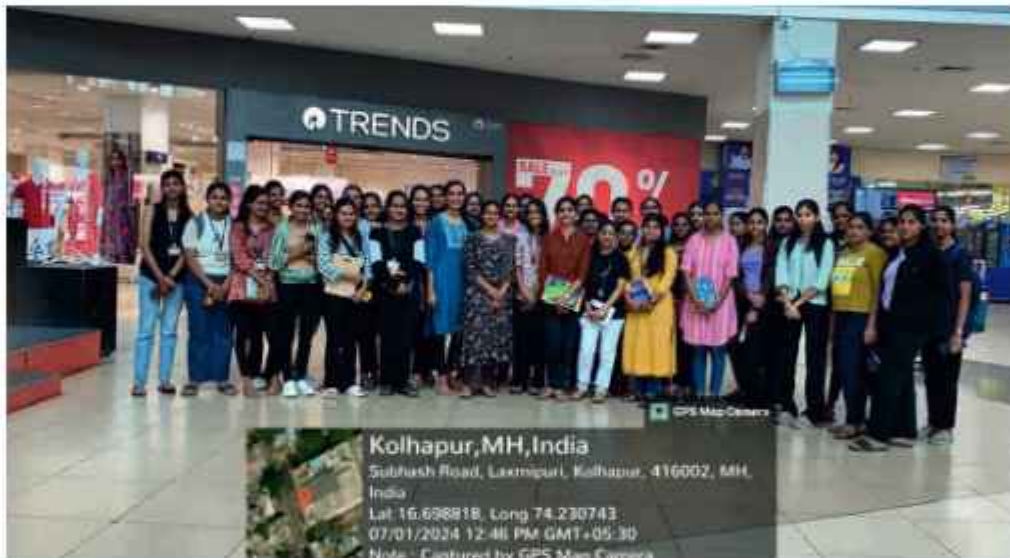
Group Photo During Site Visit