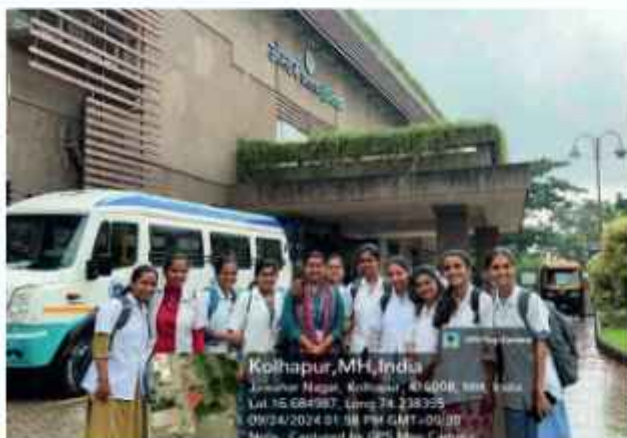
Study Tour of PGDND students to Aster Aadhar Hospital