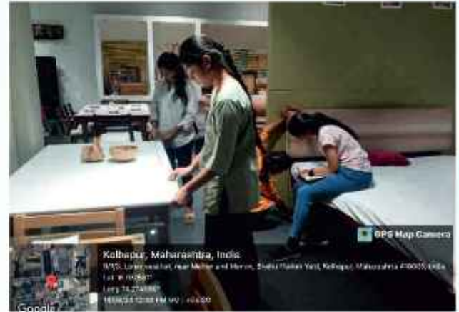
Student's observing different types of furniture