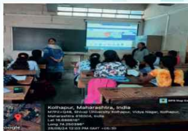
Swayam Orientation session for B.Com students