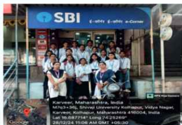
Field Visit to SBI e- corner