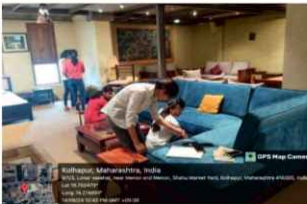
Site Visit to Kajave Furniture Showroom, Kolhapur