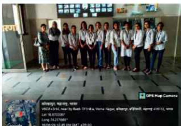
Study Tour of M.Sc.(FSN) II students to Warna Dairy