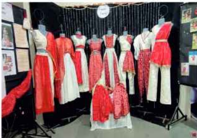
Wear by 3rd year students Group – 1 & group –2