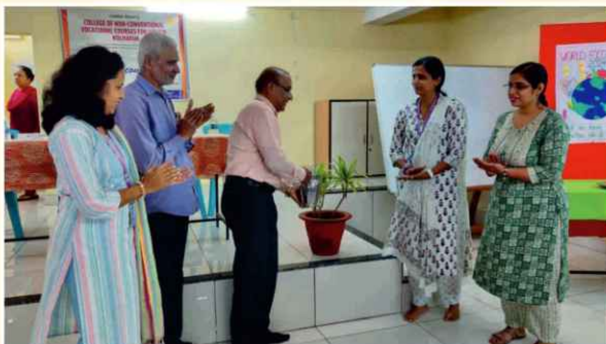
World Food Day - Inauguration