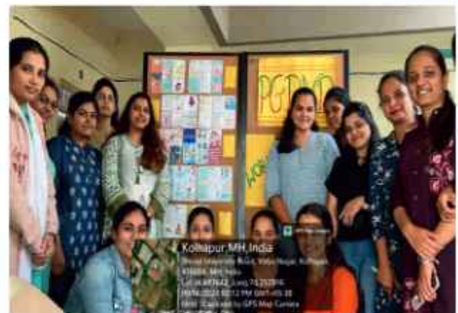
Brochure Display on Importance of Breast Feeding by PGDND students